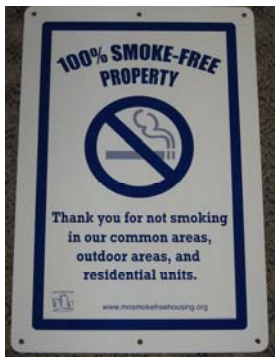
Outdoor Metal Sign – Smoke-Free Property