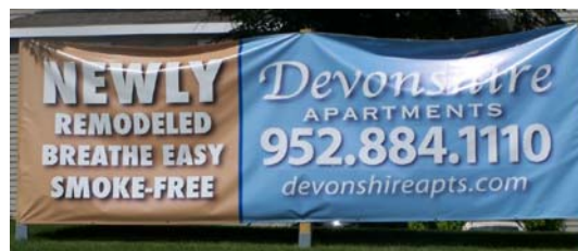
Devonshire Apartments customized a banner for their property