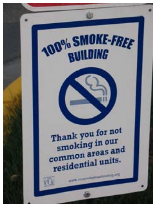
Large metal sign

View the order forms to see all available materials!