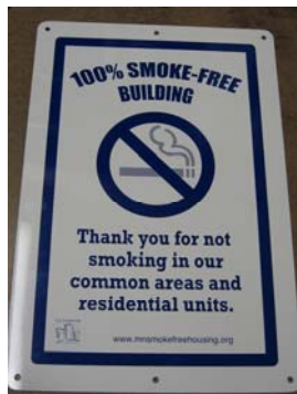
Outdoor Metal Sign – Smoke-Free Building