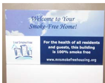
Magnetic Shopping List