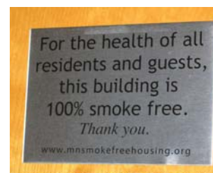
Metal Door Plaque