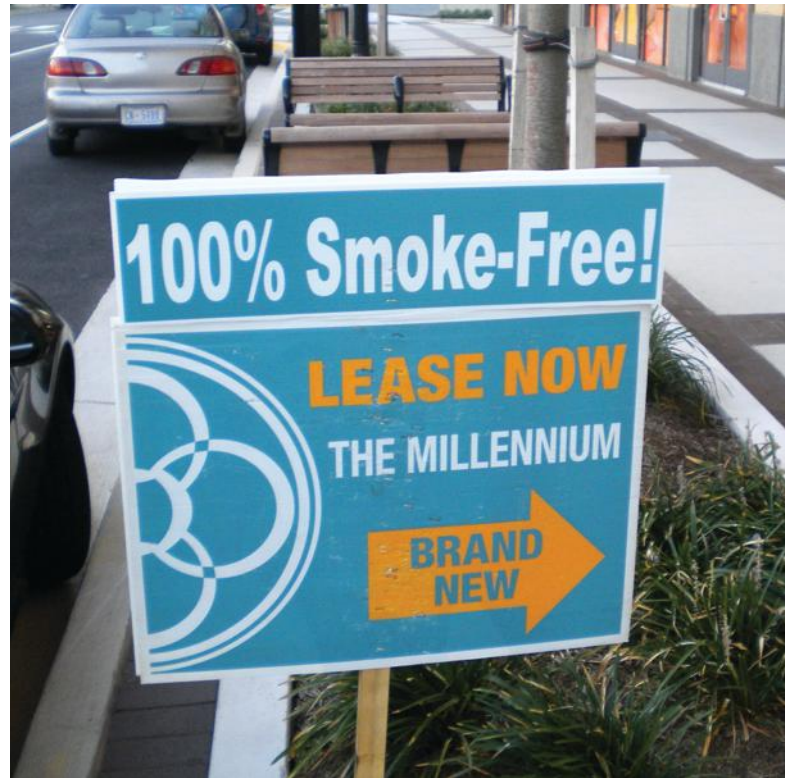
At the Millennium at Metropolitan Park in Arlington, Va., 69 percent of respondents to a survey said the community’s smoke-free policy factored “very much so” in their decision to lease.