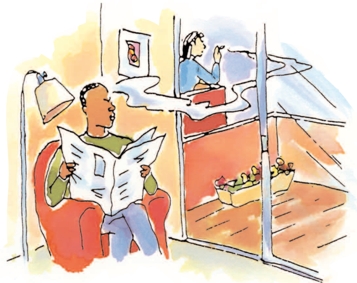
Illustrations by Janet Cleland © California Department of Health Services

As a general rule, it is unwise to file a lawsuit unless you have suffered significant harm. Your chance of convincing a court that you have a justifiable legal claim is far better if you can show that you have been harmed badly by repeated, unwanted exposure to secondhand smoke in your apartment—for instance, if you have visited a doctor with frequent respiratory complaints, missed work due